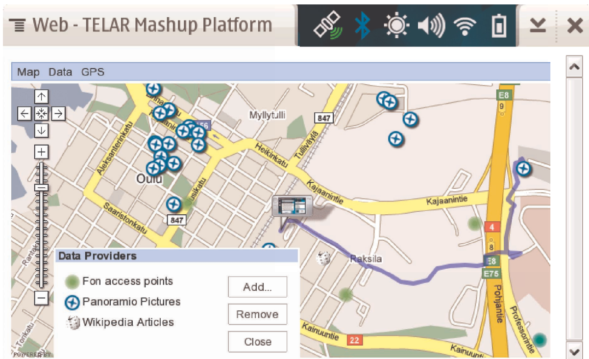
Figure 1: Screenshot of a sample Telar Mashup on a Nokia N810 Internet Tablet